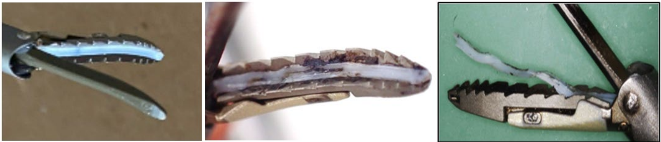
Figure 2. Example of Thunderbeat Probe in accordance with specifications (Left), Tissue Pad Deformation (Center), Tissue Pad Detachment (Right)