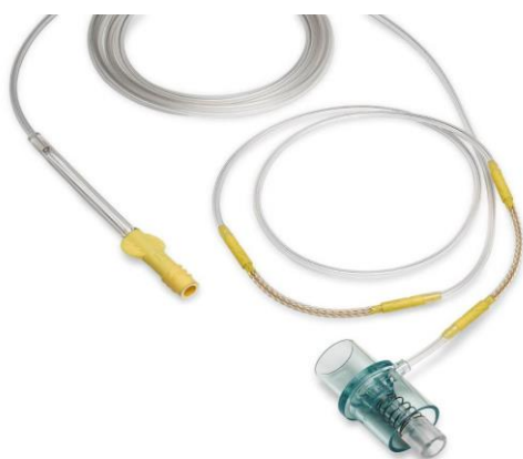
Microstream Advance Neonatal-Infant Intubated CO2 Filter Line