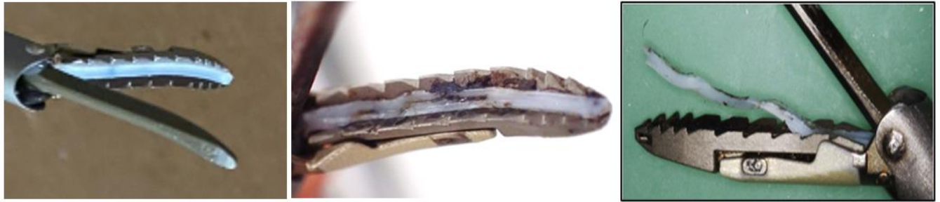
Figure 2. Example of Thunderbeat Probe in accordance with specifications (Left), Tissue Pad Deformation (Center), Tissue Pad Detachment (Right)