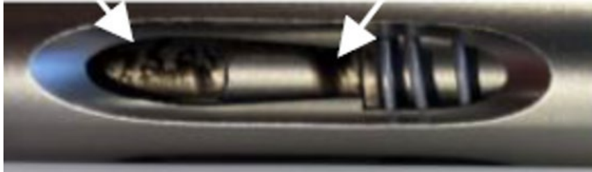
Figure 1: Heterogeneous coating of the Pin Chuck

If a device contains heterogeneous coating, an additional device may be required resulting in prolongation of surgery.