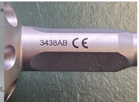
Figure 2: Engraved Lot Number