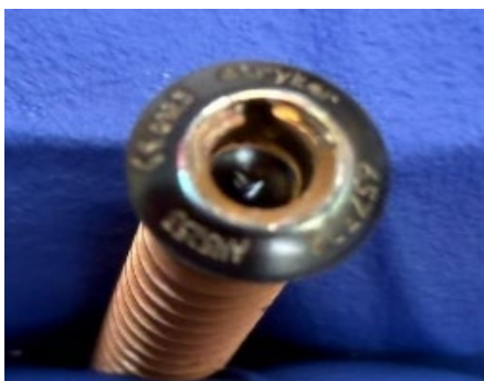
Figure 1: VariAx 2 Locking Screw without missing hex feature

Potential risks The hazard associated with this issue is the loss of function of the implant and impaired mating with the associated screwdriver.