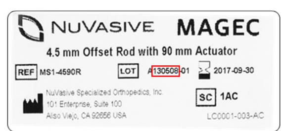
Figure 2: Representative patient chart label showing device lot number. The 6-digit numerical string (e.g. 130508) is indicated by the red box.

To determine the date of manufacture, identify the 6-digit numerical string within the lot number. The device lot number is provided on the label and/or recorded in the patient record. A representative patient chart label is shown in Figure 2.